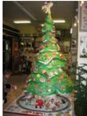
"Extreme Christmas Tree" TLC